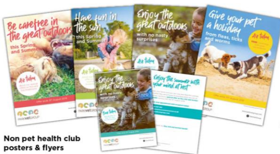
Non pet health club posters & flyers

If you are running a Flea, Tick or Wormer offer use code FTW19