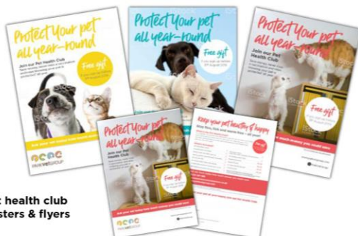
Pet health club posters & flyers